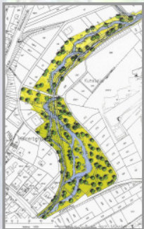
First conceptual planning

In the Feuerbach valley nearby Zazenhausen the residents will soon come across a place for recreation, cycling and strolling. Plants and animals will find new habitats. The start of construction of the REURIS revitalisation project is scheduled for autumn 2010, the opening for spring 2011. The planners aim at involving stakeholders and the interested public.