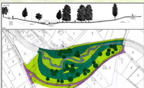
Pilot project - Plan for planning and building permission

The planners are going to hold a think tank (future conference) in March 2010. Adjoining owners, residents, farmers, associations, land owners, stakeholders and the interested public are invited to participate and to bring forward their ideas and concerns. Additionally, they are going to organise various events such as a ground-breaking ceremony, visits of the building site or guided walks as well as an opening party after completing the revitalisation.