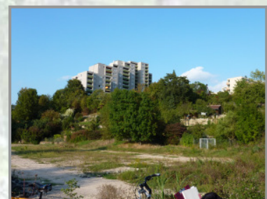
The abandoned sports field, in the background the high-rise buildings of district Freiberg