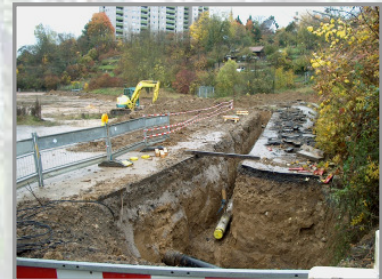
Transferring of a gas pipeline – precondition to the revitalisation