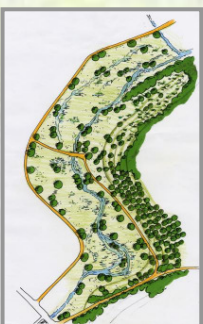
Development of the whole valley – idealistic idea